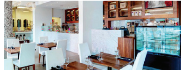
Bella Gelateria's new Yaletown location opens Thursday, Aug. 28.