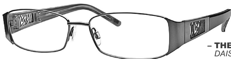
— THE SMART GIRL DAISY FUENTES SELENA

"YOU CAN, LIKE, TOTALLY, LIKE, LOOK WAY MORE SMARTER!"